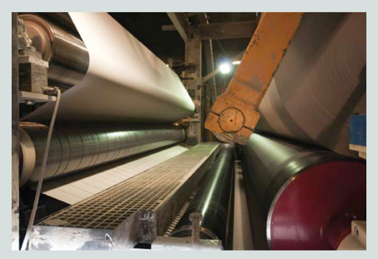
Industrial—including pulp and paper and pharmaceutical