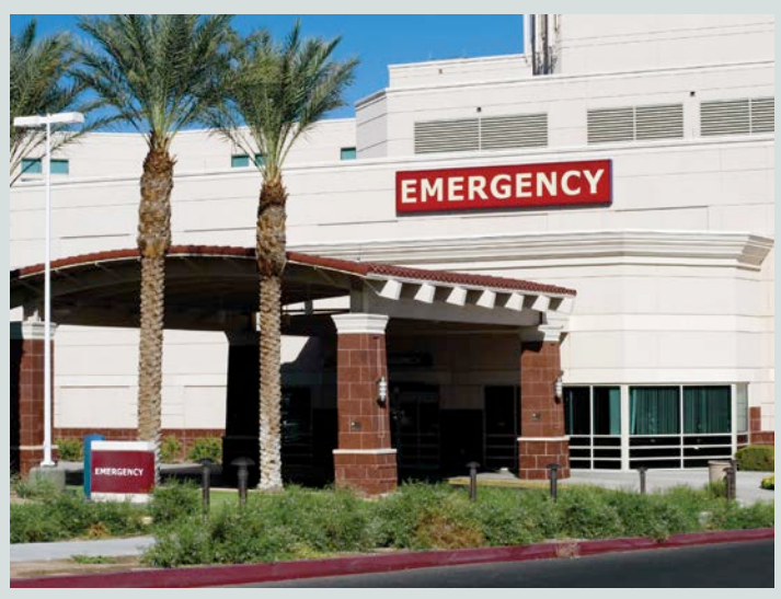
Commercial or institutional infrastructure —including hospitals, healthcare facilities and universities