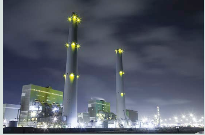
Electric utilities—including coal and gas generation and distribution systems