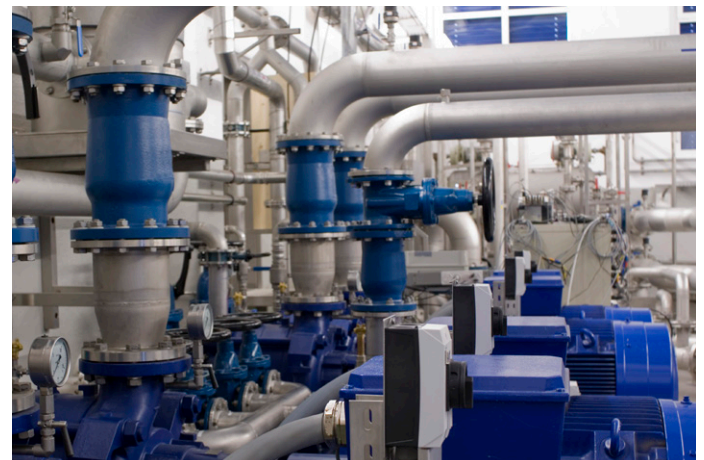
Water supply return