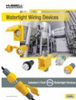
Watertight Wiring Devices