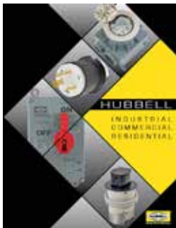
Full Line Catalog

Hubbell offers an extensive literature library for product support. Downloadable PDFs are available online.