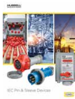
IEC Pin & Sleeve Devices