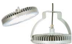
DuroSite® LED High Bay