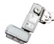
DuroSite® LED Area Light