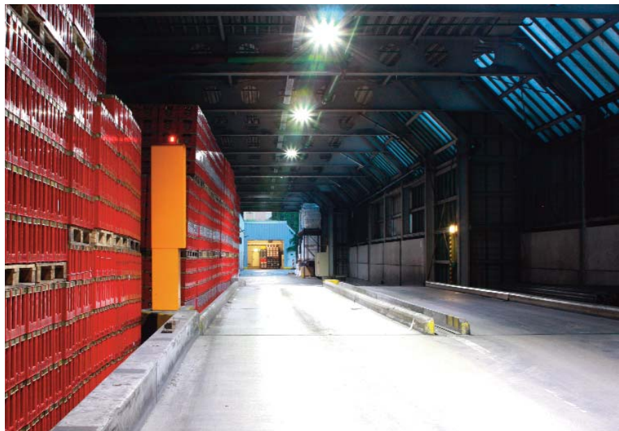
Dialight's DuroSite® Series LED High Bay Fixtures Installed in Paulaner's Munich brewery