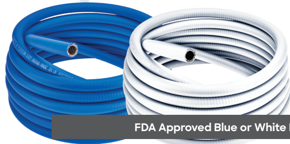
FDA Approved Blue or White Flex Conduit