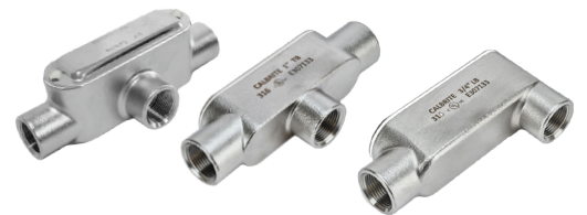
Conduit Bodies with FDA Approved White Neoprene Gasket